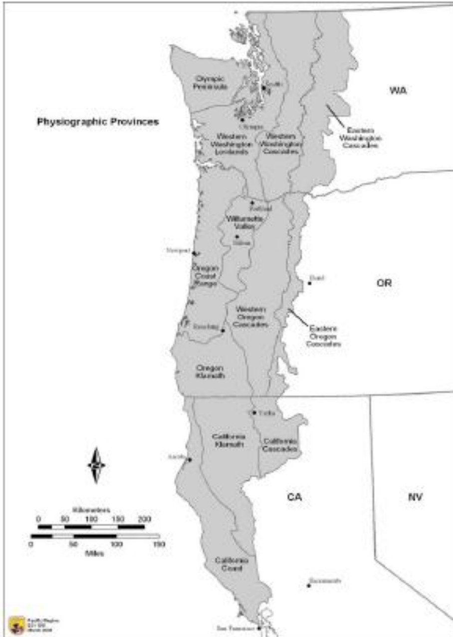
Figure A1. Physiographic Provinces in the range of the spotted owl in the United States.