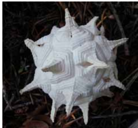
Scot Loring Creative Commons

Some types of fungi (mycorrhiza) form partnerships with plants and exchange water and nutrients for carbon. A single plant may be associated with dozens of species of fungi. Some mycorrhiza can connect many individual plants/