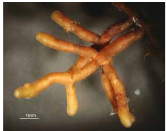
Two ectomycorrhiza of host plant Douglas-fir, with fungus Russula sp. (above) and Tuber sp. (below).