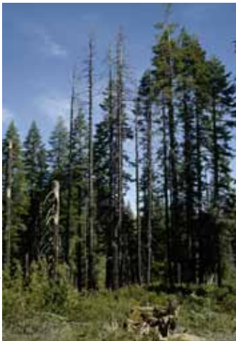
Don Owen, CAL FIRE

Root diseases kill their host by destroying the root wood, plugging water-conducting tissues, killing the cambium, or a combination of these. Generally death occurs from a secondary cause: decayed roots allow windthrow or bark beetles attack the weakened trees.