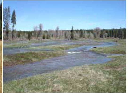
With the gully gone, water easily overflows the channel onto the floodplain. This slows the water, allows sediment to be filtered out, and aids in infiltration into the ground.