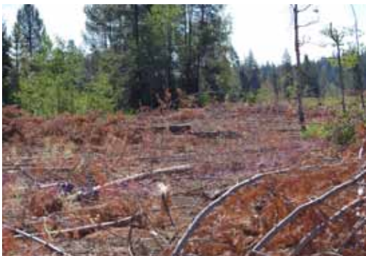
Slash was left atop the plug to help dissipate water energy and protect the plug until native vegetation becomes established.

The meadow has responded beautifully and the project achieved its goals: the stream was reconnected to the floodplain, erosion and sediment reduced, water quality improved, and there is an increase in forage and meadow plants. When the meadow is stabilized, cows will be